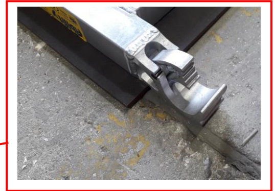
Figure 3 Spring-loaded security lock