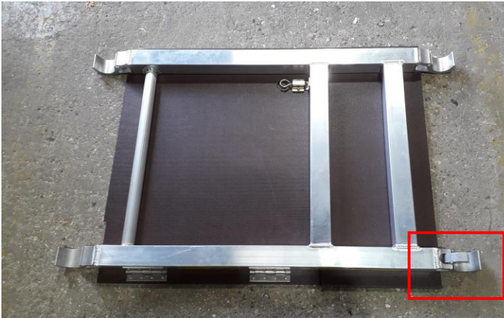
Figure 2 Underside of platform standing deck